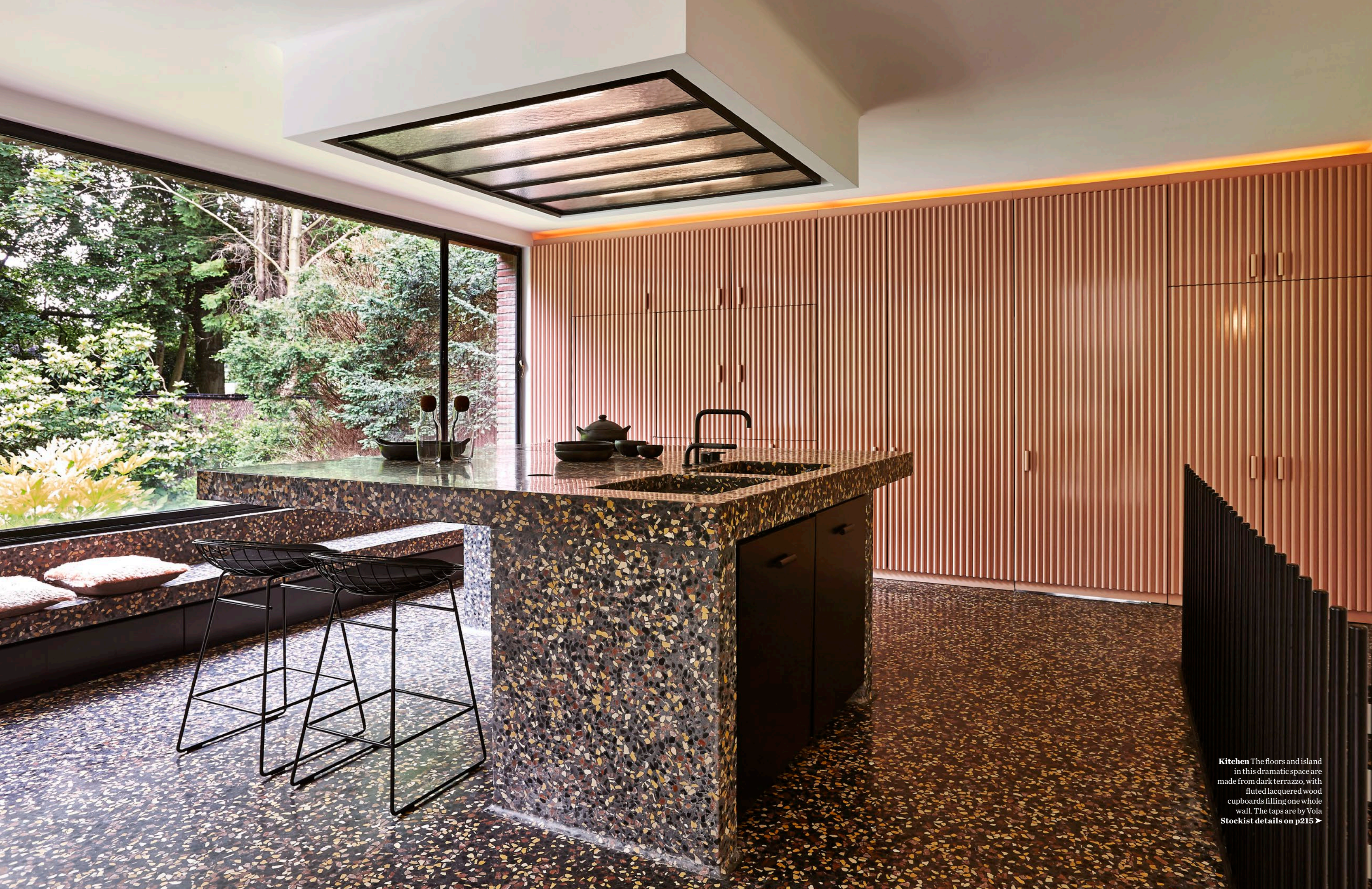
Kitchen The floors and island in this dramatic space are made from dark terrazzo, with fluted lacquered wood cupboards filling one whole wall. The taps are by Vola Stockist details on p215 ►