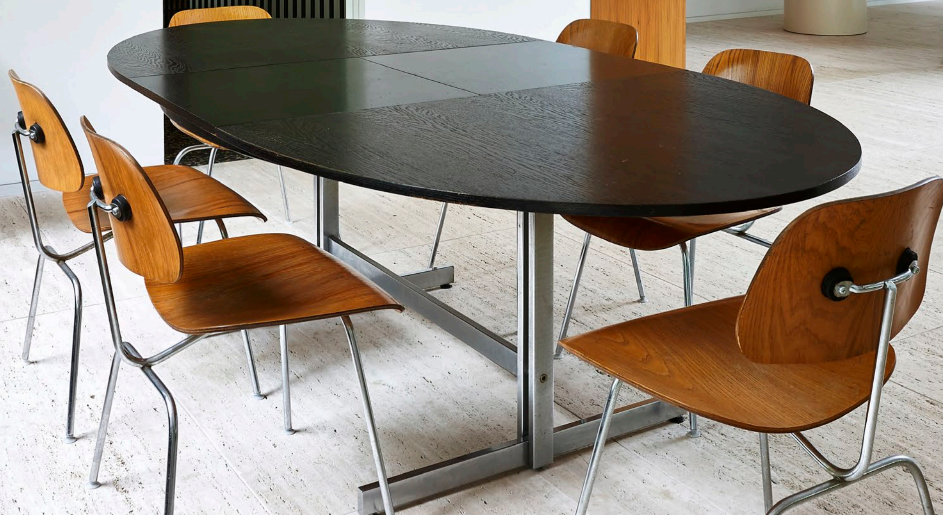
Dining area This open-plan area leads through into the kitchen. On the wall there's a photo of Le Corbusier's Unite d'Habitation residential building in Berlin by Marianne Karssing ►